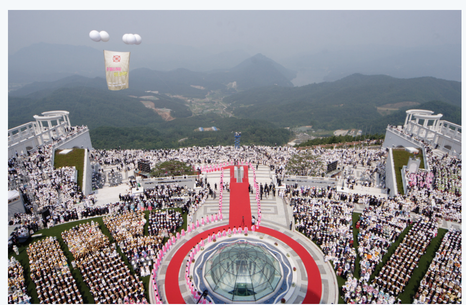
More than 5,000 people filled the Cheon Jeong Gung Museum plaza for the ceremony, but many times that number were watching from nearby

The perfection stage of donation is 34 percent. When you go beyond 34 percent, you enter the era of the direct dominion of God, but that summit cannot be crossed. When you look at the world today, you can see that it is nearing the end of its days. It is without an owner. Aren't your body and mind in conflict?