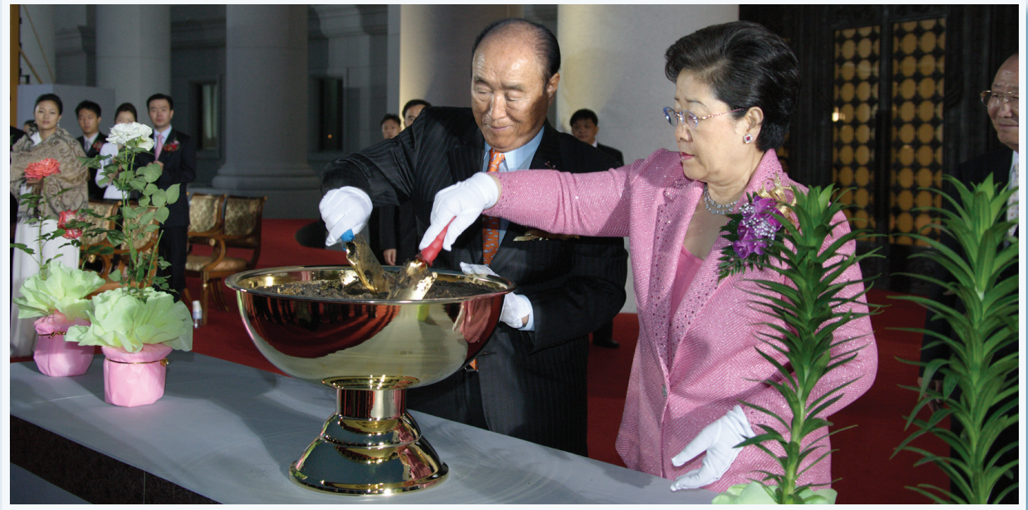
At the Dedication and Conferment of Cheon II Guk Soil and Water, True Parents received soil and water from ten continental representatives, which they mixed all together in one large bowl. After mixing it with soil and water from the Cheongpyeong Holy Ground, (representing the creation of Heaven and Earth) True Parents redistributed it (as mud) to the ten continental representatives. At the same time, True Parents gave a rose (symbolizing man) and a lily (symbolizing woman) to them as the Conferment Ceremony of Cheon II Guk Flowers, representing the 5<sup>th</sup> and 6<sup>th</sup> "days" of the Creation, on which God created animals and plants.

know the tradition of the fertilized ova. Would the fallen people, who do not know what the seed is that is to be planted in the deep, traditional valley of the ovum become owners? They could never become owners. Therefore the Messiah needs to come. The True Parent needs to come. The false parent must vanish. Do you understand? [Yes.] We really should conclude now.