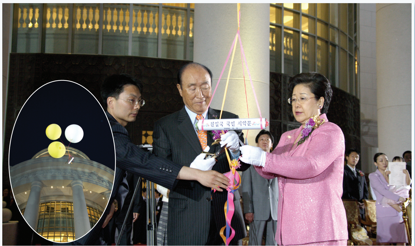
At the beginning of the first of eight days of celebration, June 6, on a stage representing the Creation, a second-generation couple led the audience in reciting a pledge that was created by the Witnessing Department to be used only on that day. At the appropriate moments, the multitudes replied in Korean "I do swear." True Parents then took the paper containing the Cheon II Guk Citizen's Pledge, attached it to balloons and released it to the heavens.

sinned out of ignorance, they cannot be judged.