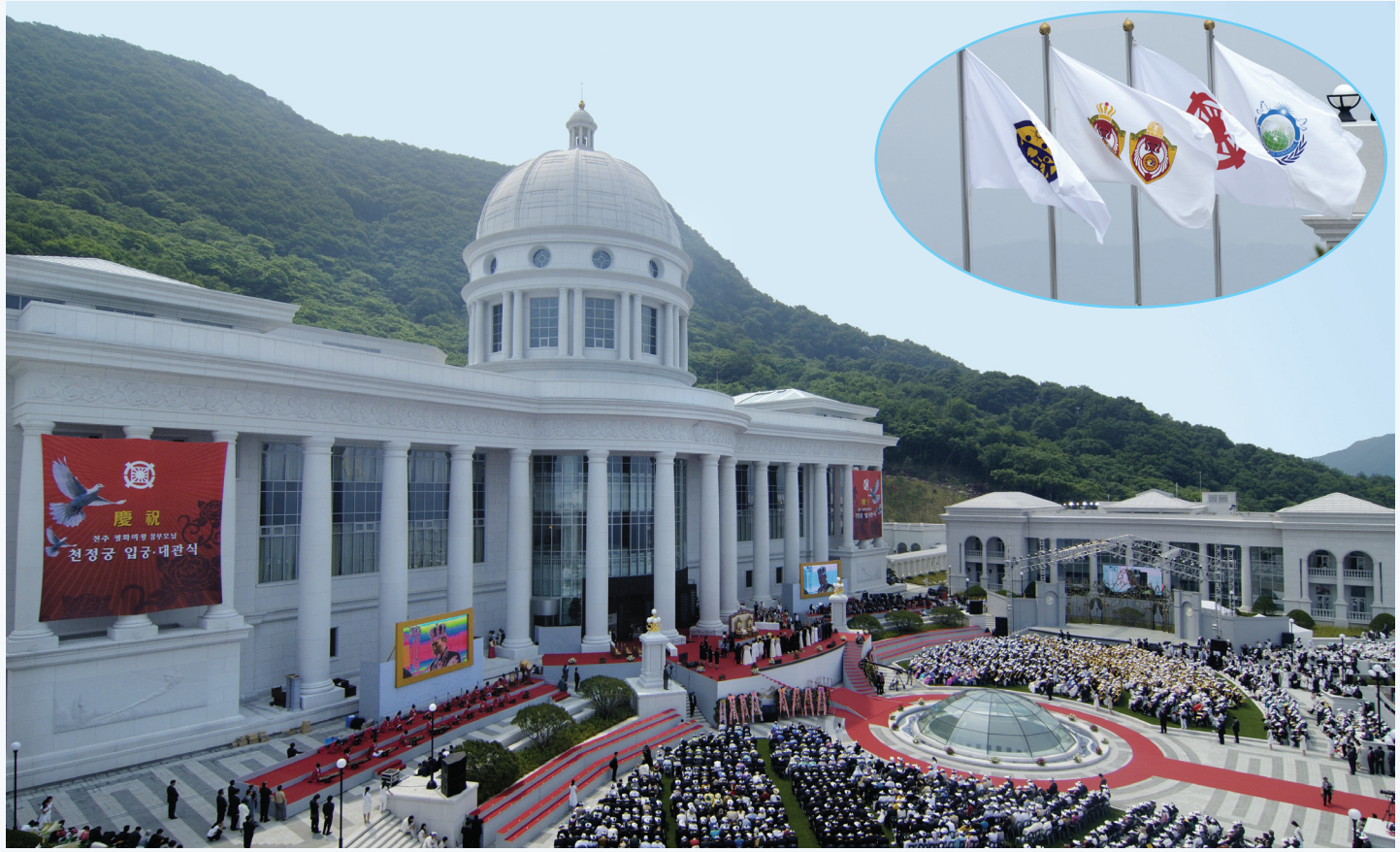
At the Cheon Jeong Gung Museum, flags (inset: FFWPU, True Parents; Cheon II Guk, UPF) rose to strains of Blessing of Glory , the Cheon II Guk anthem, on June 13, 2006, as a crowd of more than 5,000 joined True Parents for the Declaration of the Establishment of Cheon II Guk

day, the True Parents brought to a close the time before the coming of heaven with its long years of grief, and opened the era after the coming of heaven, the new era when we can build a new heaven and a new earth. This marked the beginning of a great and historic revolution to return the Earth to God as a substantial reality.